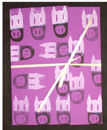
Some designs were refreshingly whimsical!