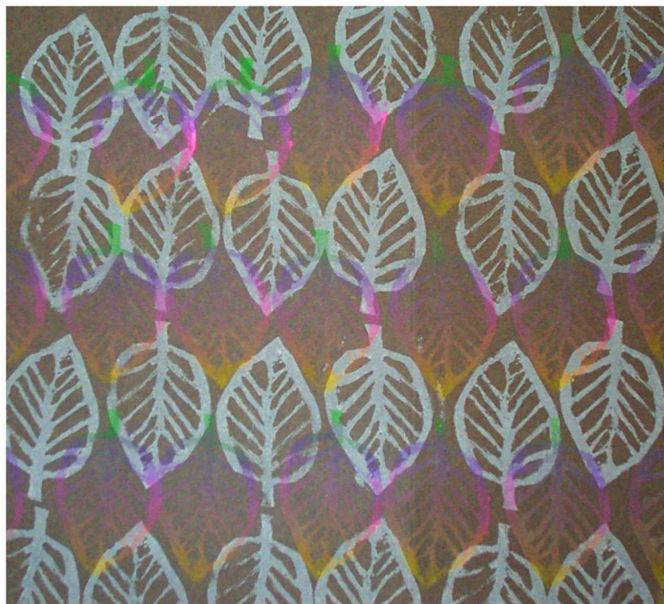
Sample of a student printed paper.

Making the Portfolios: The printed papers were wrapped around thin cardboard covers (cut from cereal boxes) that were slightly larger in all dimensions than a standard letter-sized sheet of paper. The printed papers were adhered to the covers with glue sticks, except for the edges for which a thick craft glue was used for durability.